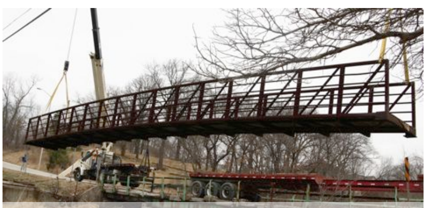
THEN: The Lantz Welch Bridge originally being placed at Weatherby Lakes's North Cove & Barry Rd.