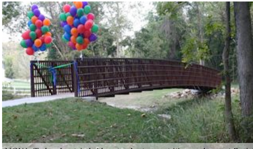
NOW: Today, Lantz's bridge stands strong at it's new home at Prairie Creek Trail in Platte County

Originally, Lantz Welch gifted Weatherby Lake with a footbridge that provided access across the north end of Weatherby Lake at Barry Road. Approximately 20 years later, when Barry Road was widened, the bridge was re-gifted to Platte County where it has set in a field waiting for just the right location to utilize such a fine bridge. (Cont'd. On Pg 8)