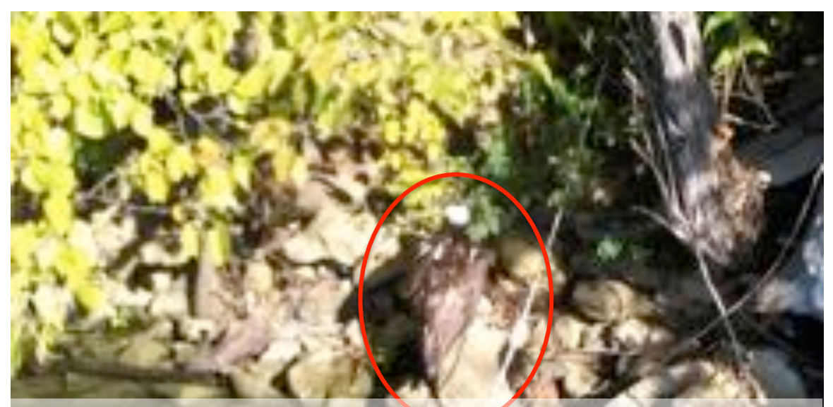
An injured Osprey, spotted by a Weatherby resident and reported to the police. The Missouri Department of Conservation was called and the bird – rare for our parts – was recovered and taken to a rehabilitation facility.