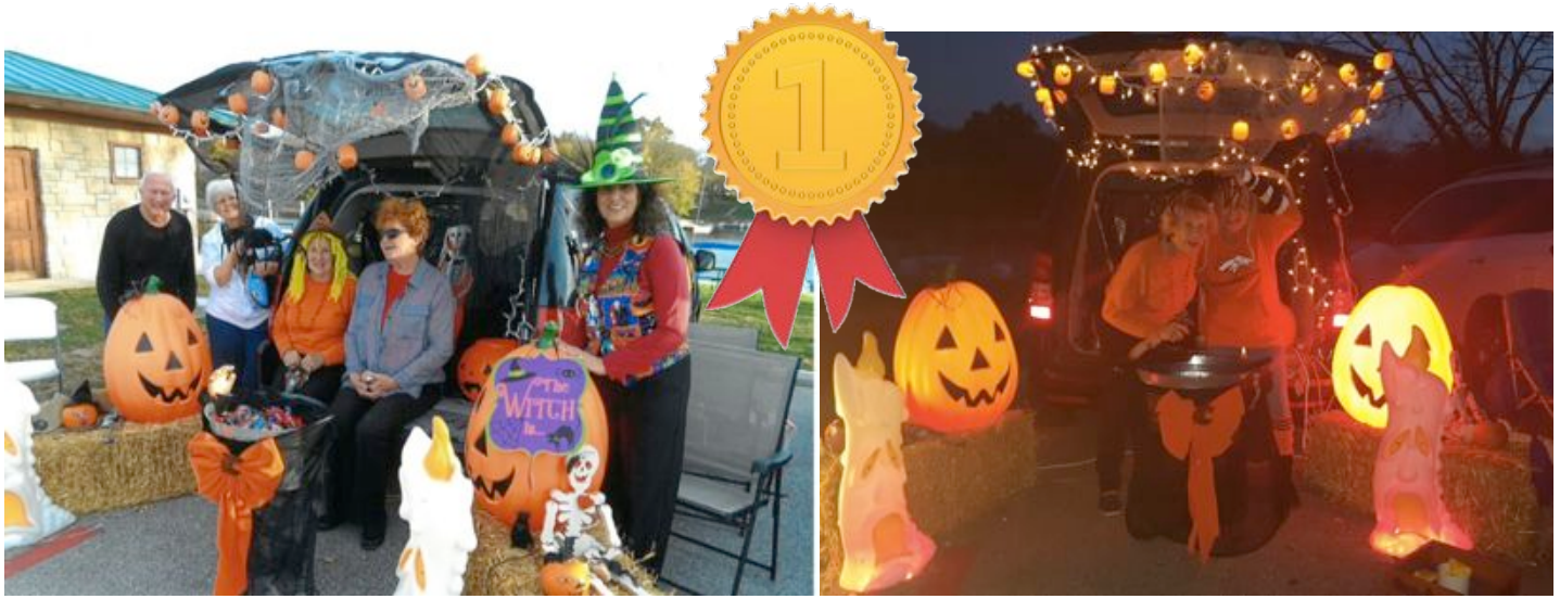
Congrats WL Garden Club! 1 st Place Trunk Winner