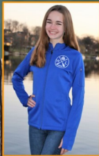
Women's Full-Zip Hooded Jacket Sizes: XS-XL $50 Sizes: XXL-XXXL $55 Color Options: Black / White / Graphite / Grey / Navy / Royal Blue / Red / Pink