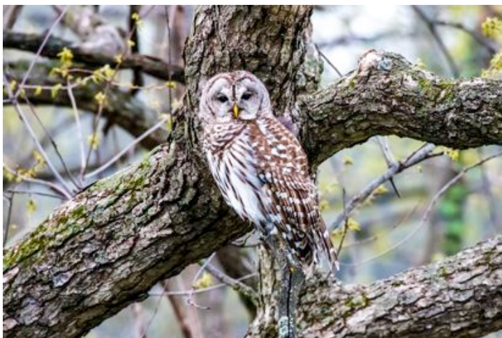
Here's looking at you.