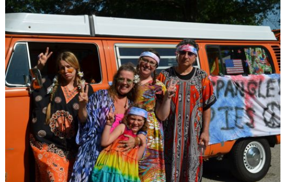
Star Spangled Hippies...of the WLIC office!