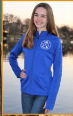
Women's Full-Zip Hooded Jacket Sizes: XS-XL $50 Sizes: XXL-XXXL $55 Color Options: Black / White / Graphite / Grey / Navy / Royal Blue / Red / Pink