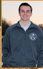
3/4 Zip Pullover Sizes: XS-XL $50 Sizes: XXL-XXXL $55 Color Options: Black / Graphite / Grey / Navy / Royal Blue / Red

WL Logo apparel samples in various popular colors are available to view at City Hall (M-F 8am-4pm) along with WL Note-cards, maps of the lake, WL Historical Chronicles and more.