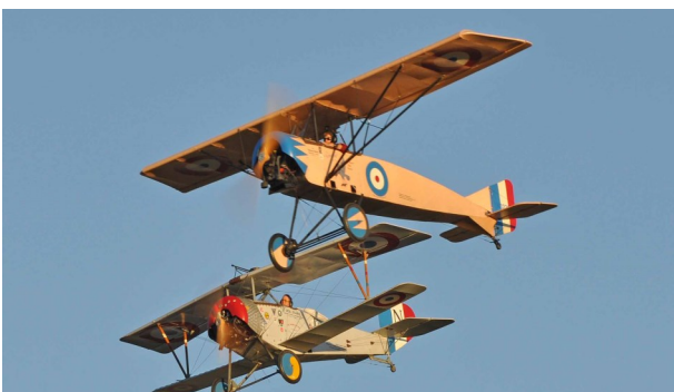
Sharon and Dick make a pass down the flight line at an air show.