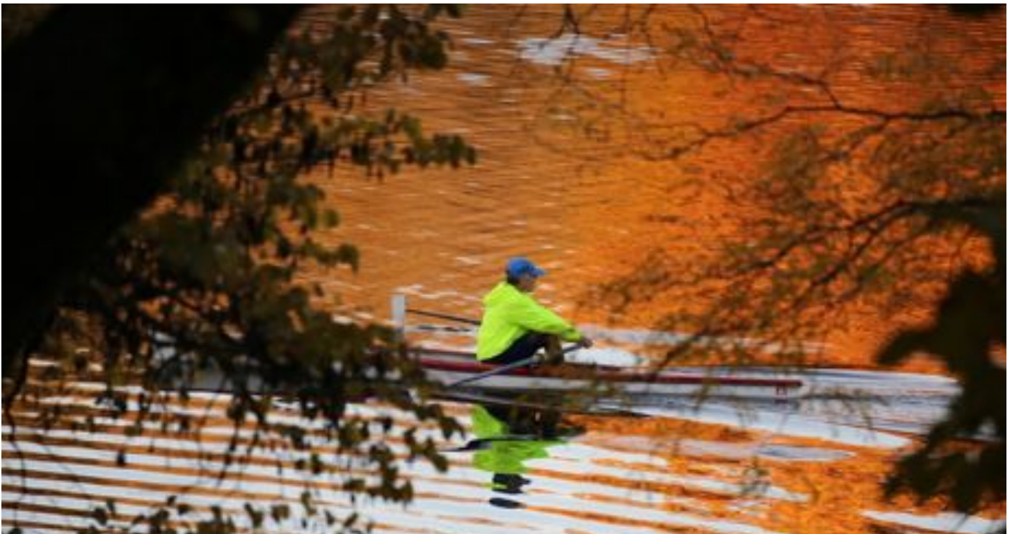
A lone boater takes one last morning paddle, leaving the glories of Fall behind...