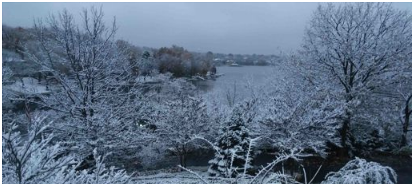
The awesome beauty of winter enters!