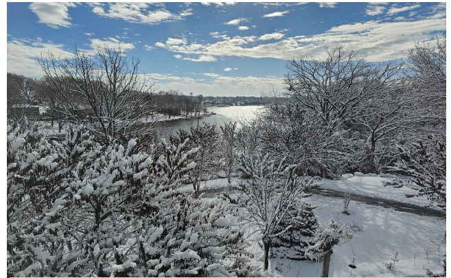
SUNNY SNOWY DAY ON LAKE

I'm especially obsessed with the sight of smoke floating out of every neighbor's chimney...it's my favorite part of this hibernation...knowing that under every smoking rooftop chimney is a neighbor who has the same opportunity for the abundant blessings that our entire community is gifted with. It takes the quiet of hibernating to step back, sit still, and recognize the uncountable ways that all of our lives are enriched.