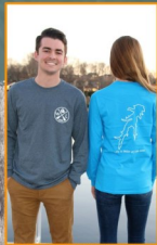
Long-Sleeve T-Shirt Adult Sizes: S-XXXL $25 Youth Sizes: S-L $15 Color Options: Sapphire Blue / Dark Grey