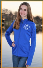
Women's Full-Zip Hooded Jacket Sizes: XS-XL $50 Sizes: XXL-XXXL $55 Color Options: Black / White / Graphite / Grey / Navy / Royal Blue / Red / Pink