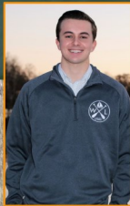
1/4 Zip Pullover Sizes: XS-XL $50 Sizes: XXL-XXXL $55 Color Options: Black / Graphite / Grey / Navy / Royal Blue / Red

WL Logo apparel samples in various popular colors are available to view at City Hall (M-F 8am-4pm) along with WL Note-cards, maps of the lake, WL Historical Chronicles and more.